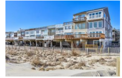
7801 Atlantic 2 Ave Ocean City MD