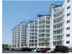
6 60th 101 St Ocean City MD