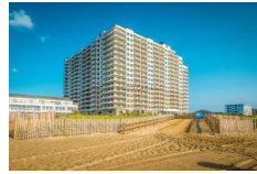
2 48th 1512 St Ocean City MD